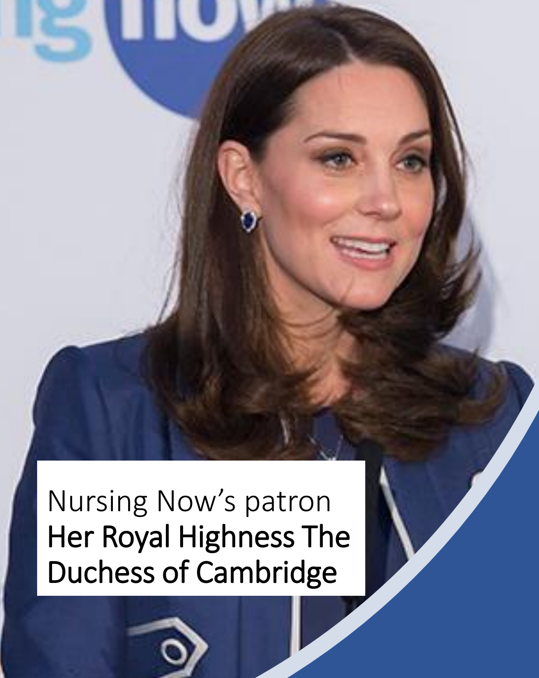
Nursing Now's patron Her Royal Highness The Duchess of Cambridge